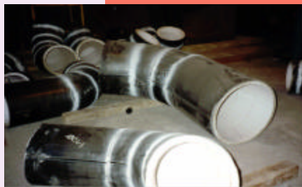
PULVERIZED FUEL ELBOWS