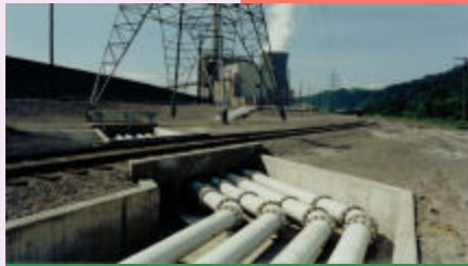
BOTTOM ASH PIPEWORK